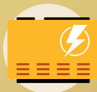
Generator Power Backup