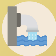
Sewerage Treatment Plant